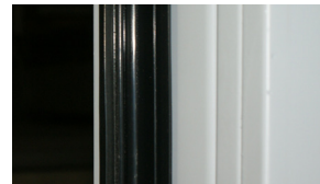
Proprietary Composite Silicone Polymer Compression Seal