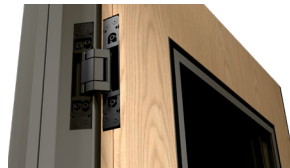
3-Axis Adjustable Concealed Hinge

Featuring a patented concealed hinge design, Alexis seamlessly integrates visual appeal with exceptional acoustic performance. Experience the pinnacle of sophistication and sound control with Alexis - where engineering meets elegance.