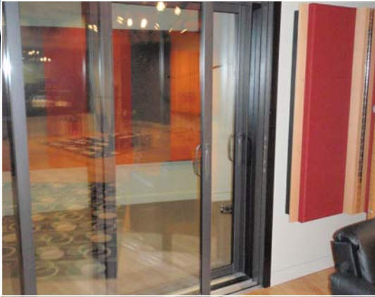
Tandem Configuration - STC46