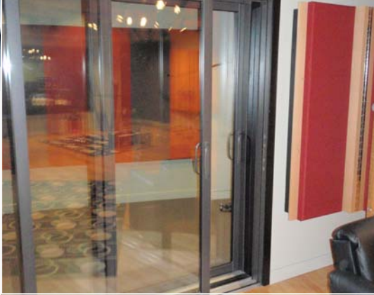
Tandem Configuration - STC46