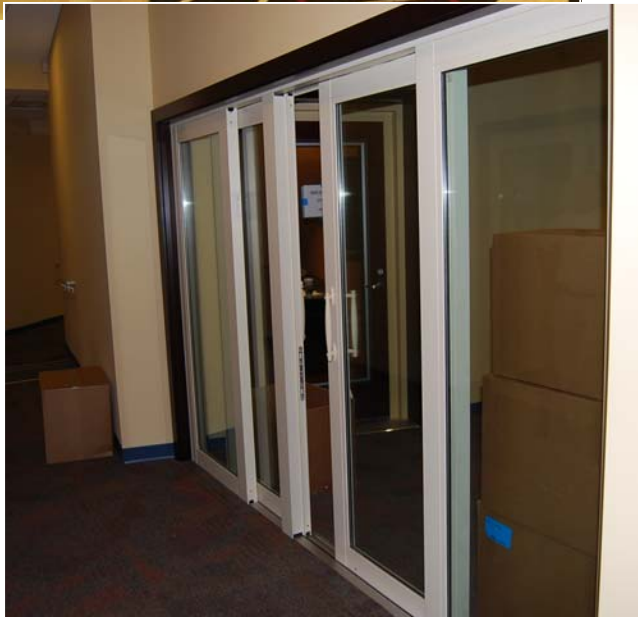
Bi-Parting - STC35