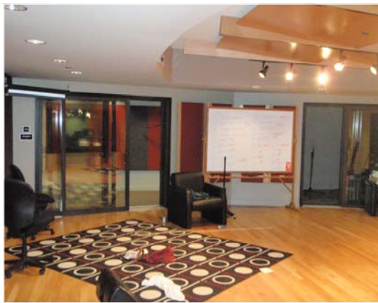
Tandem Configuration - STC53 (on right)